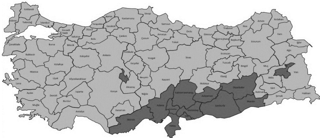
Figure 1: Proposed Target Provinces and Development Agencies

The proposed project of 39.5 Million EUR aims to support women and youth within refugee and host communities' transition into sustainable economic opportunities and increased social cohesion through the micro-grant support provided by the selected 5 Development Agencies (DAs) covering 11 provinces (Adana, Mersin, Gaziantep, Adiyaman, Kilis, Mardin, Hatay, Osmaniye, Kahramanmaraş, Diyarbakir, and Sanliurfa) (see Figure 1), where vulnerable refugee reside the most. The project (i) expands economic opportunities for mostly women refugee and host communities through support for social enterprises and vital livelihoods facilities; (ii) improve social cohesion among refugees and host communities through enterprise development and participatory engagement in livelihoods facilities.